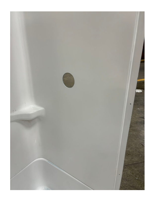
Drill pilot hole(s) from back.